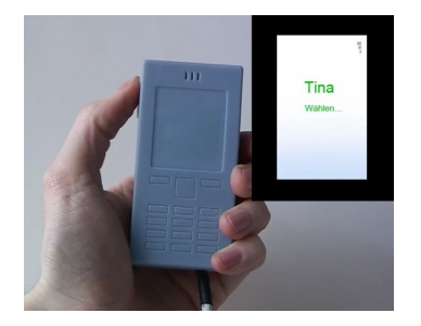
Fig. 1: Final prototype, consisting of mobile-phone shaped box and an external screen interface